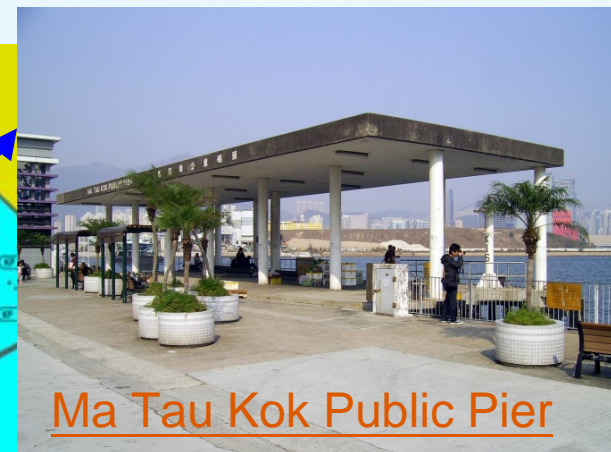
Ma Tau Kok Public Pier