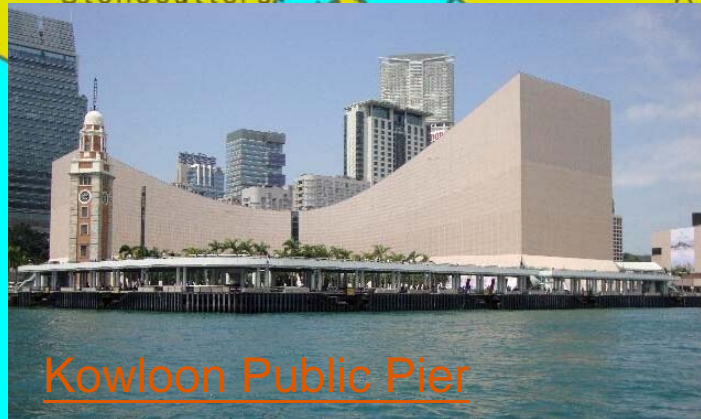
Kowloon Public Pier