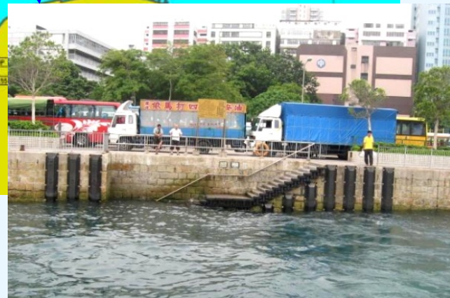
King Wan Street Landing