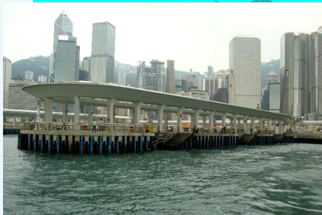
Central Pier No.9