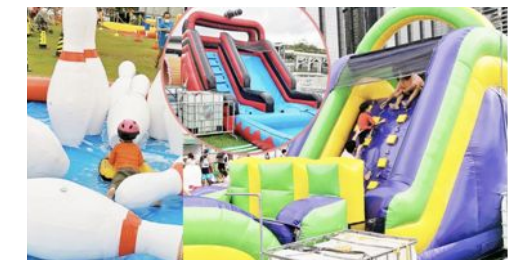
Summer Aqua Kids (Aug)