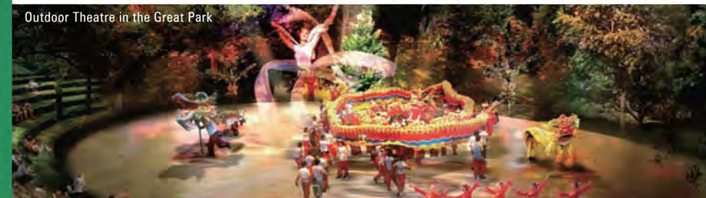
Outdoor Theatre in the Great Park