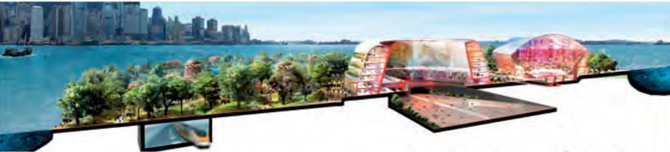
Mega Performance Venue and Exhibition Centre

We have enhanced the preferred Conceptual Plan and incorporated desirable features from the other two master plans wherever appropriate to make the Cultural District a place to relax and be inspired. It will be, in every aspect, a Place for Everyone.