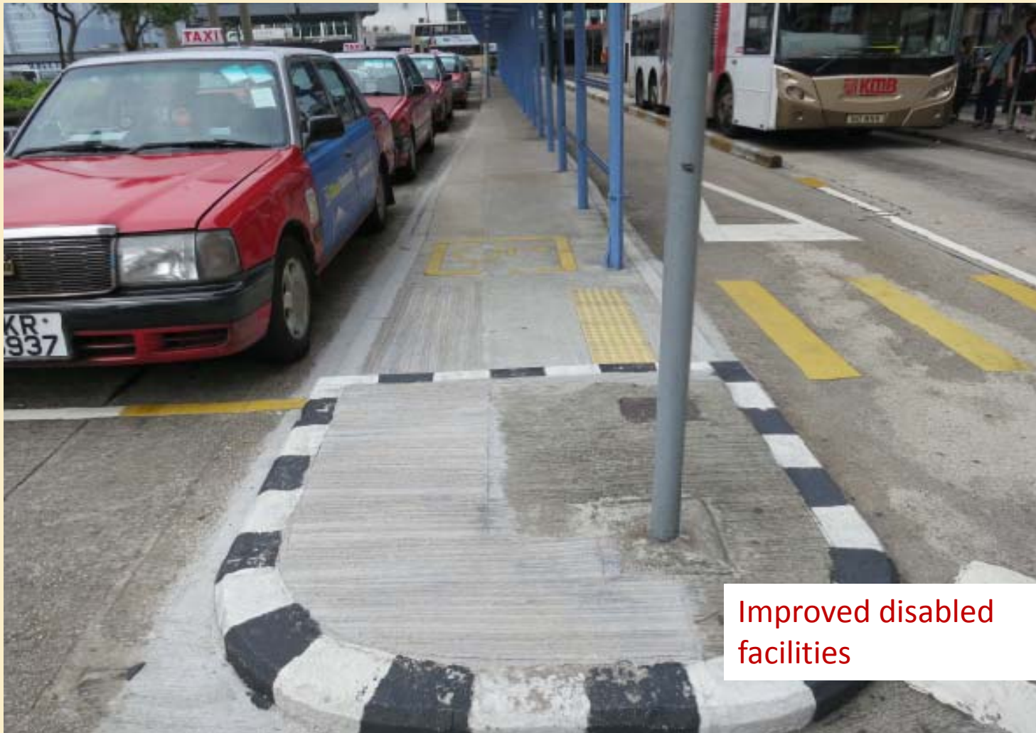
Improved disabled facilities