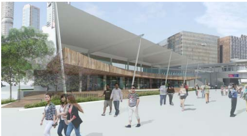
Hub 1 – “Eateries”