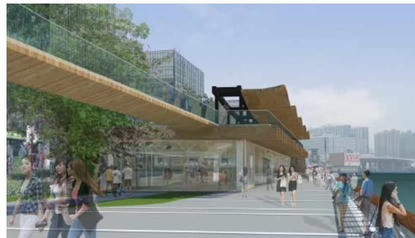
Hub 2 – “Explorative”