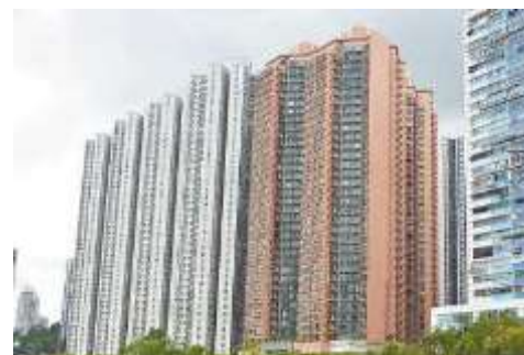
2 Serenade Cove