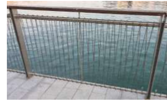
4 Seawall Railing with design concept of Thread