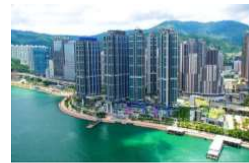
6 Ocean Pride