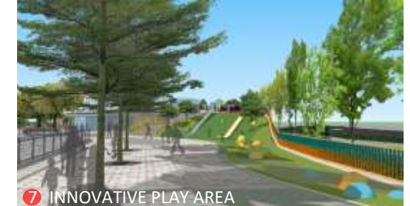
7 INNOVATIVE PLAY AREA