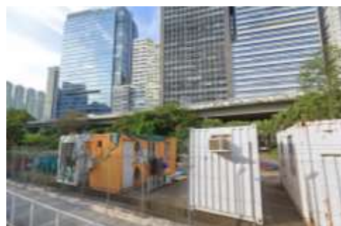
3 Hoi Hing Road