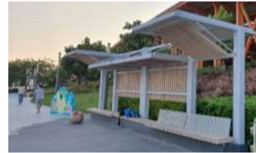
1 Rain Shelter with design concept of Curtain