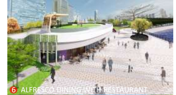
6 ALFRESCO DINING WITH RESTAURANT