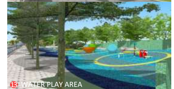
13 WATER PLAY AREA