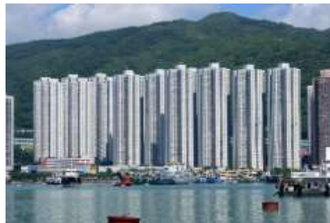
1 Belvedere Garden