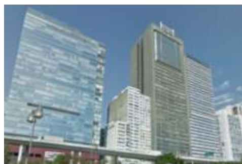
4 Industrial Area