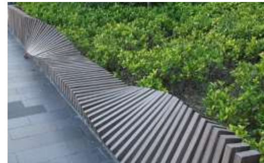
3 Bench with design concept of Curtain