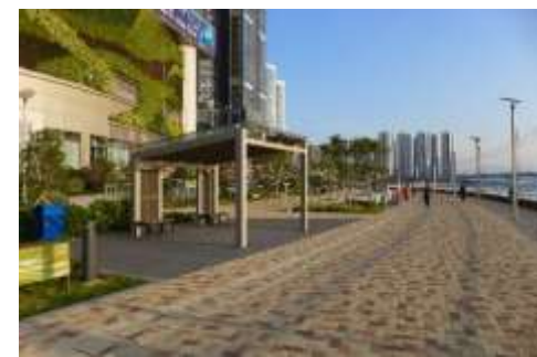
5 Tsuen Wan Park (Phase III)