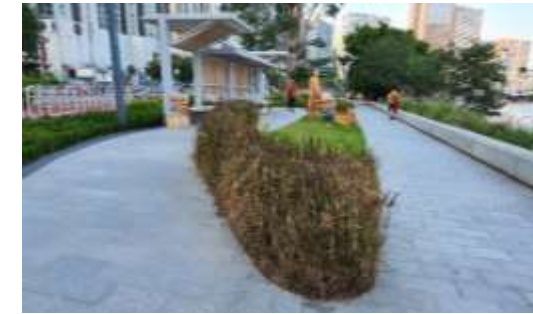
2 Promenade and Landscape