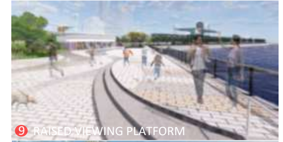
9 RAISED VIEWING PLATFORM