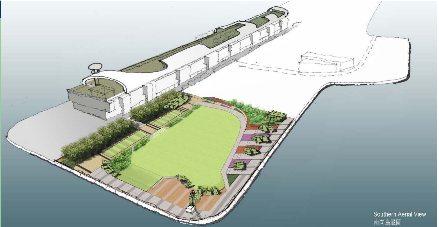
Southern Aerial View 南向鳥瞰圖