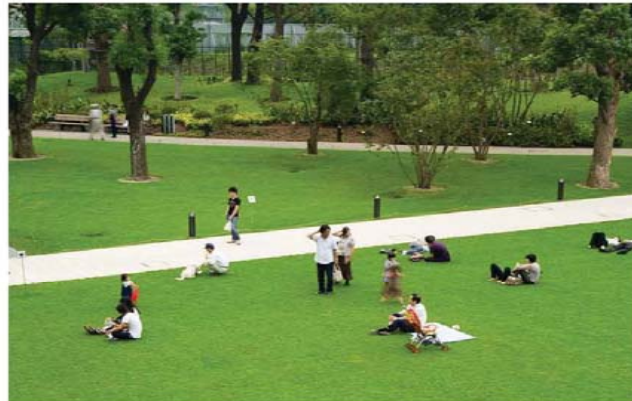
4 Flat lawn