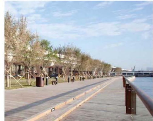
5 waterfront promenade