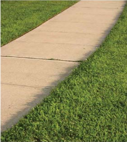
1 leisure walk