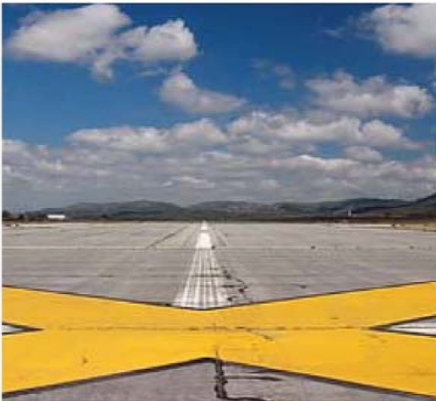
3 existing old runway