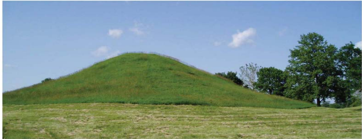
2 special landform