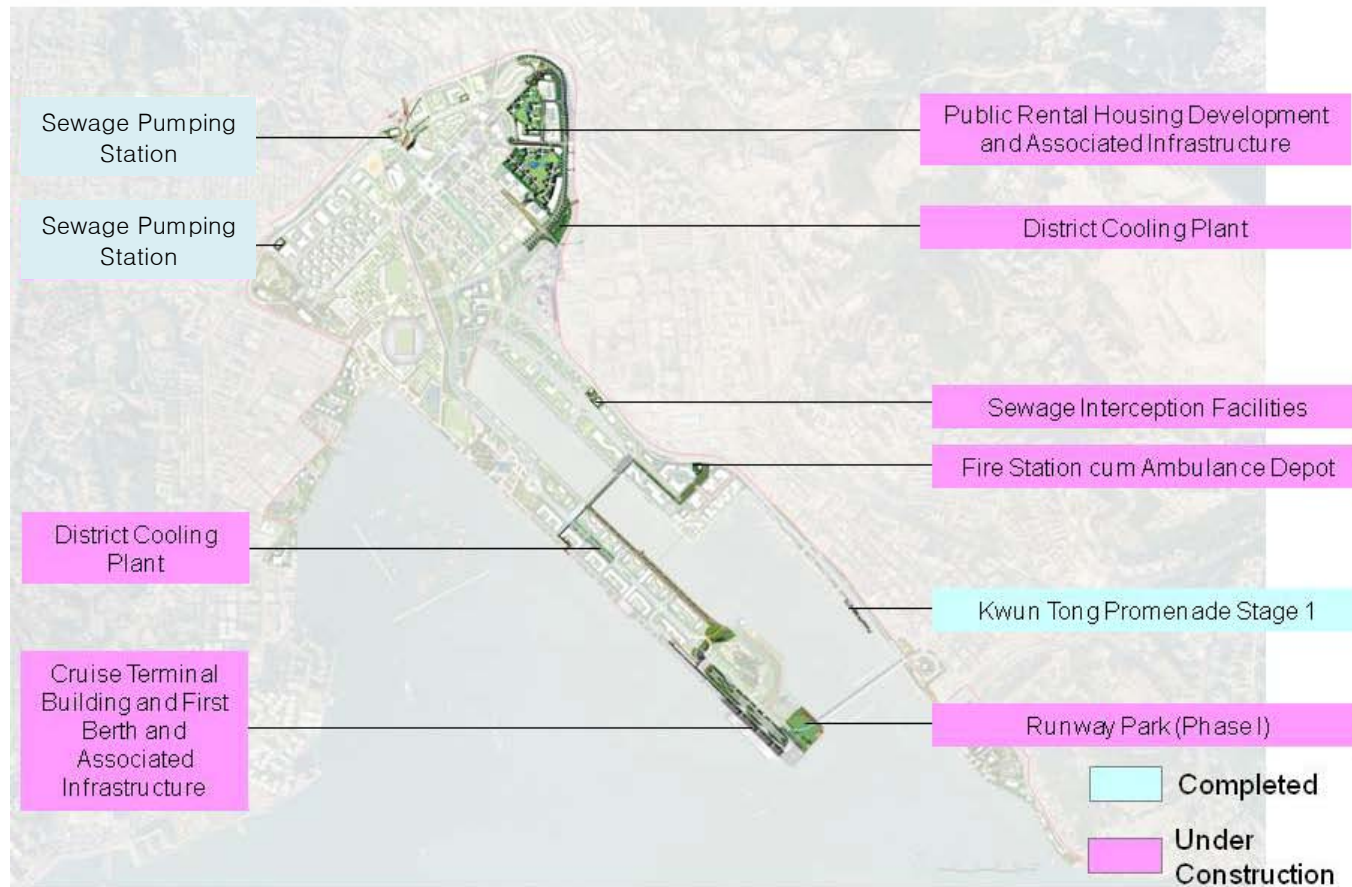
Projects Planned for Completion in 2013 (Item Nos. 4, 10 to 13 & 15 of Programme Chart)