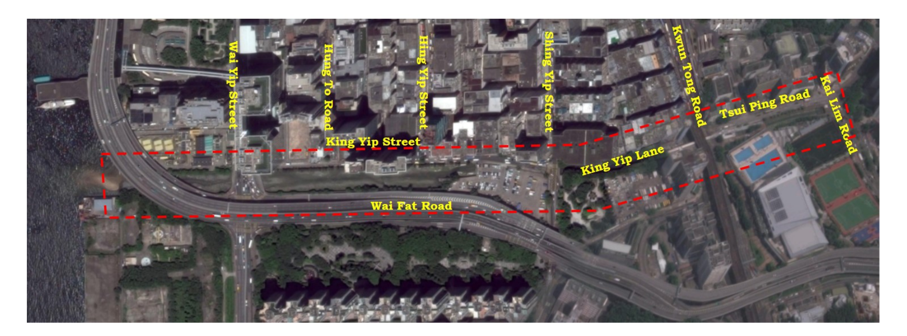
Annex A Location Plan of King Yip Street Nullah