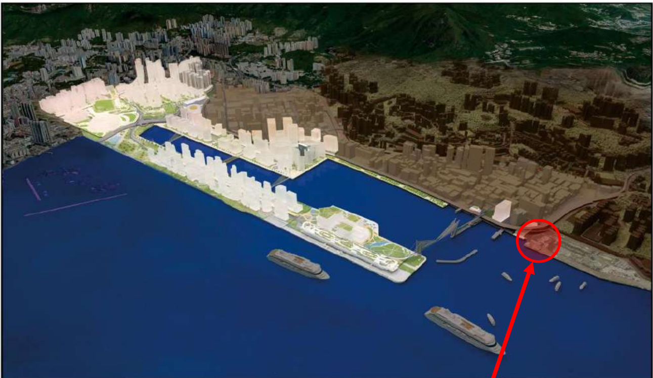
啟德發展的外貌 OVERVIEW OF KAI TAK DEVELOPMENT