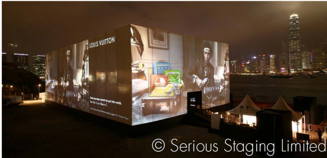
Louis Vuitton event, West Kowloon