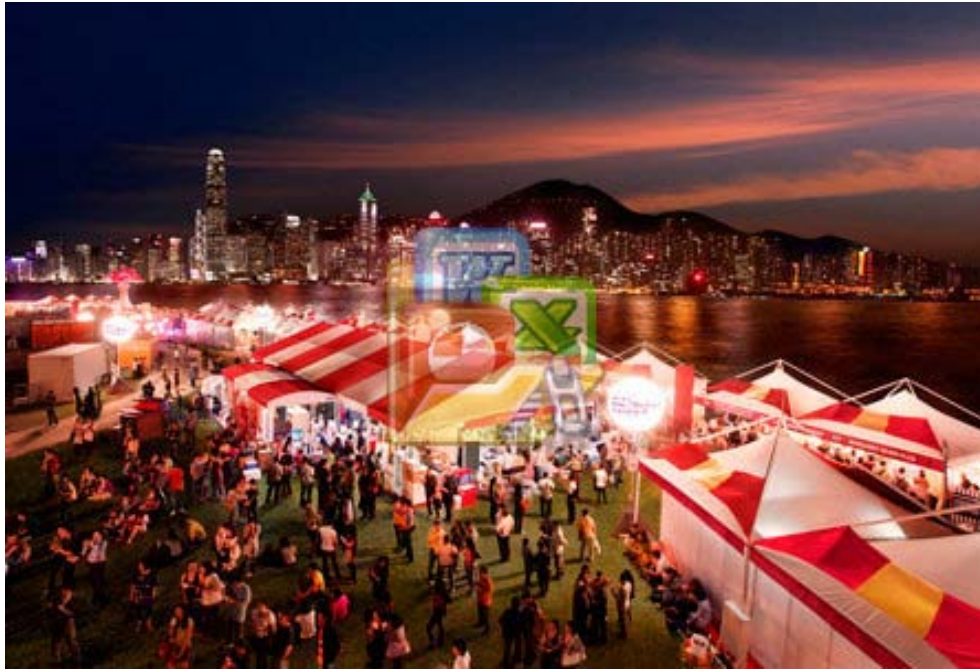
HK Wine & Dine Festival, West Kowloon Harbourfront Promenade