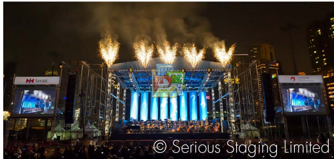
Symphony Under the Stars, Happy Valley Racecourse