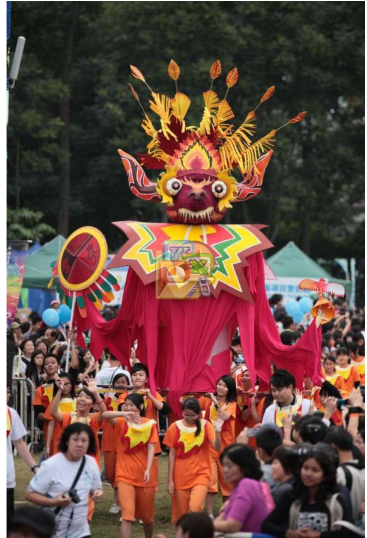
Standard Chartered Arts in the Park Mardi Gras, Victoria Park