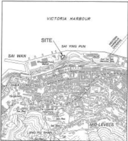
SCALE 1:20 000