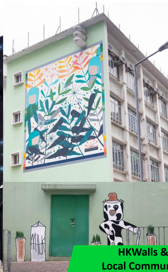
HKWalls & Local Community