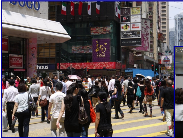
Hennessy Road outside Sogo