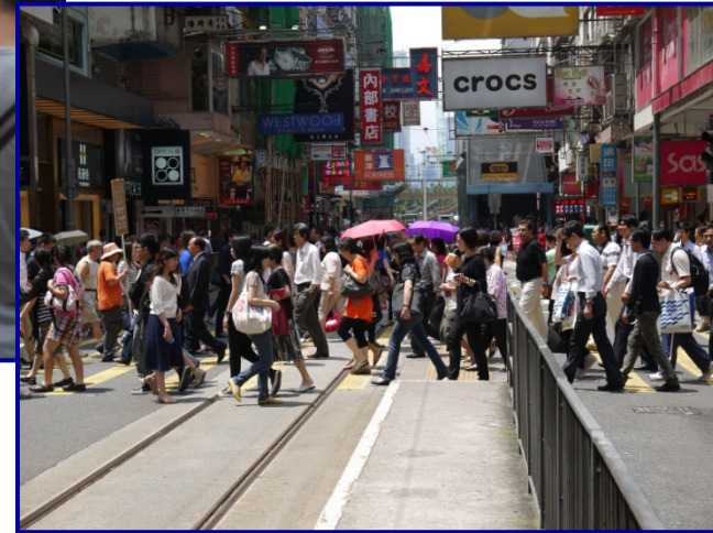
Percival Street / Russell Street