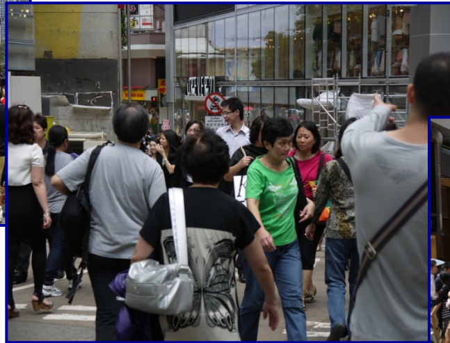
Kai Chiu Road / Jardine's Crescent