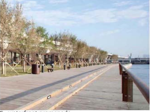
5 waterfront promenade