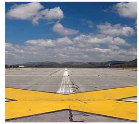
3 existing old runway