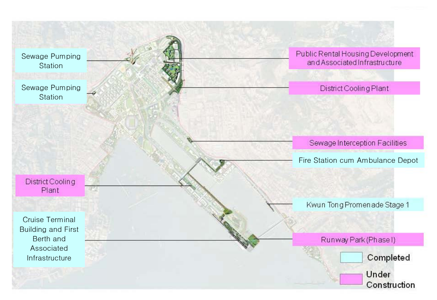
Projects Planned for Completion in 2013