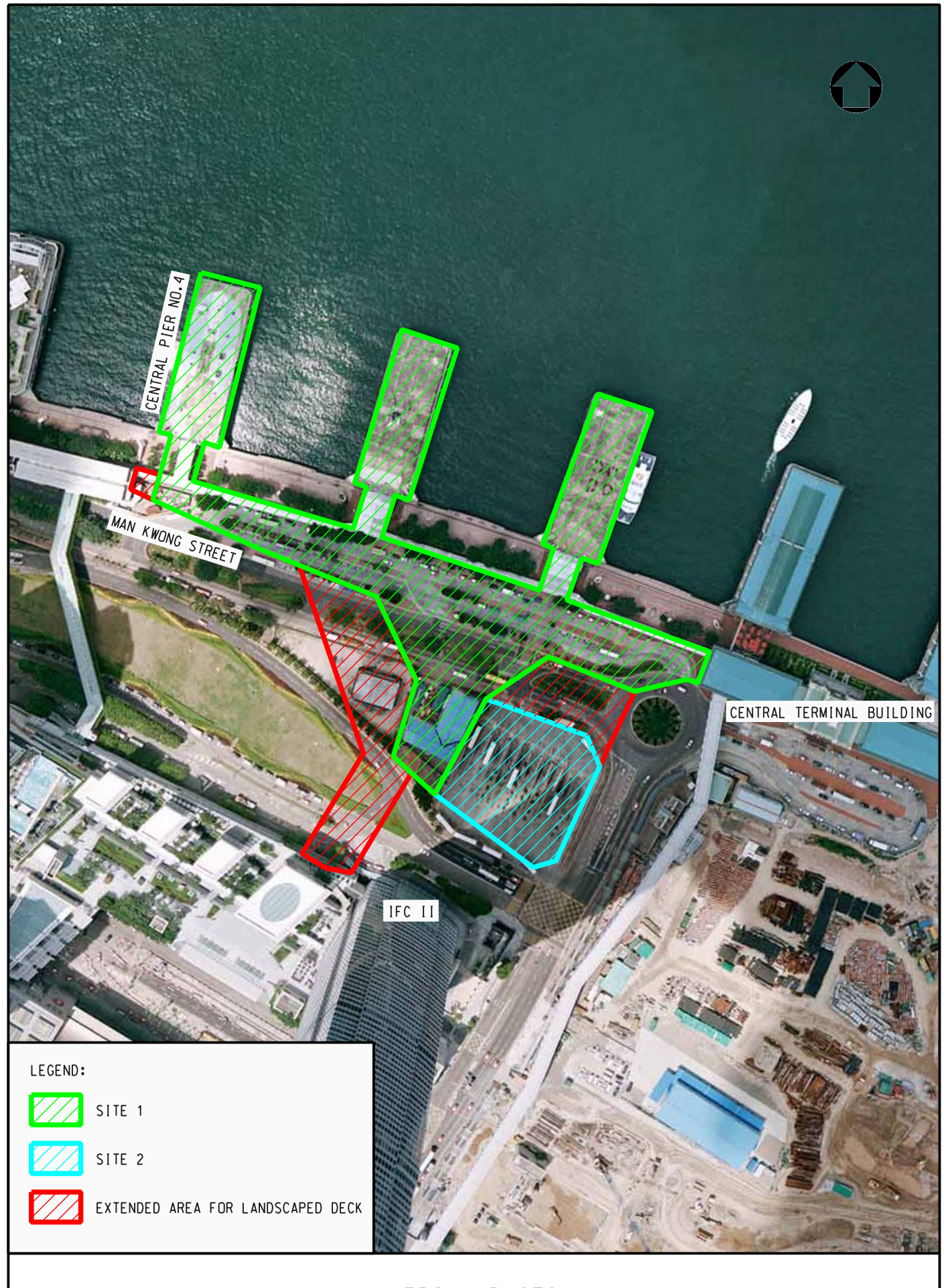
AERIAL PHOTO LOCATION OF SITE 1 AND 2 AND ADJACENT LAND