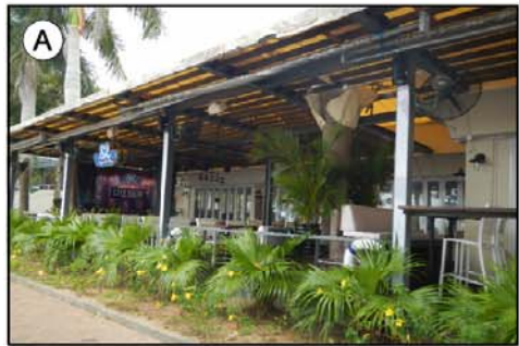
碼頭維持作海事用途 PIER FUNCTION RETAINED FOR MARINE USE